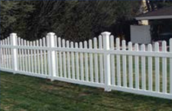
Scallop Dog Ear (4' Tall White 3" Pickets)

The Traditional line of picket fences creates a nostalgic old world feel. You will never worry about repainting these white pickets fences. DuraMax uses a durable route-and-lock design that eliminates all brackets and screws and looks equally beautiful from both sides.