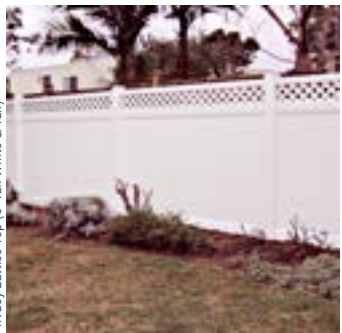
Privacy Lattice Top (6' Tall White & Tan)

Low Maintenance and Beautiful is what you can expect from our Privacy Fence line.