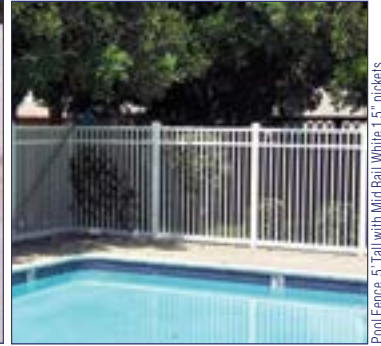
Pool Fence: 5' Tall with Mid Rail White 1.5" pickets