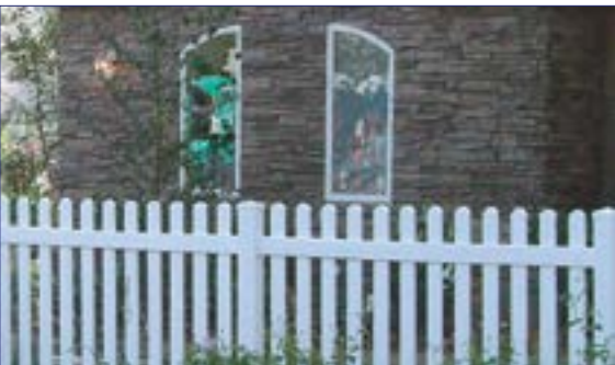
Straight Dog Ear (3" & 4' Tall White 3" Pickets)