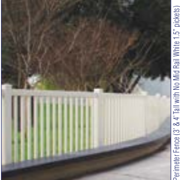
Perimeter Fence (3' & 4' Tall with No Mid Rail White 1.5" pickets)