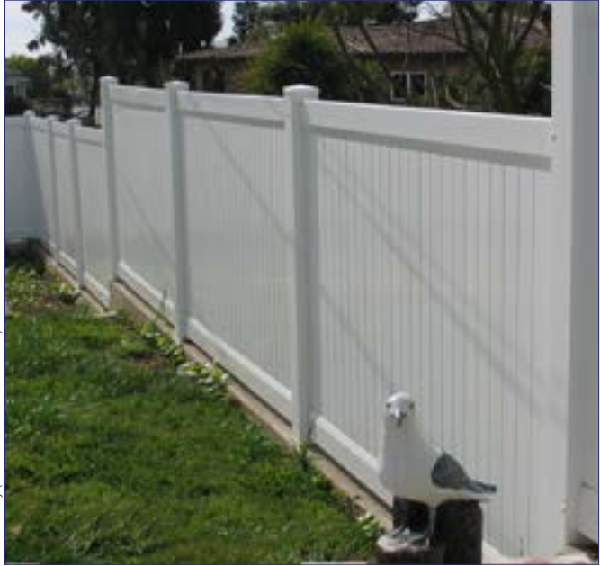
Solid Privacy (5' & 6' Feet Tall White or Tan)