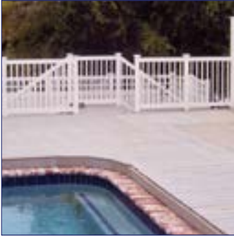
Pool Fence: 3' & 4' Tall with No Mid Rail

Routed construction provides a strong and durable fence, without unsightly brackets, screws or nails.