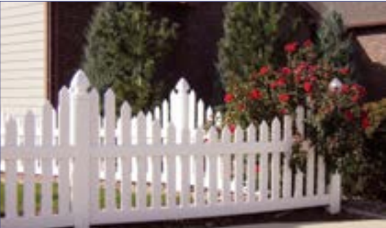
Scallop Spade (4' Tall White 3" Pickets)