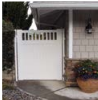
Privacy Gate w/ Accent Top (6' Tall White or Tan)

Routed construction provides a strong and durable fence, without unsightly brackets, screws or nails.