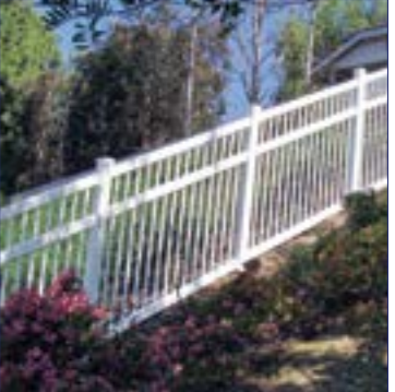
Perimeter Fence (5' & 6' Tall with Mid Rail White 1.5" pickets)

The low maintenance vinyl will never rust or need painting, making vinyl pool side fencing the ideal choice for any wet pool area.